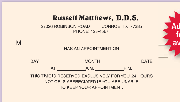
200-1 Format 10 shown

Printed in black ink with your choice of 20 formats. Additional six ink colors available for an added charge. Specify flat or raised printing on white or ivory stock. Size: 2" x 3-1/2". For two-sided cards, select a front and back format.