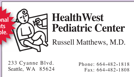
5808-1 Format D shown