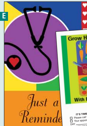
25011-1 Classic 250011L Laser