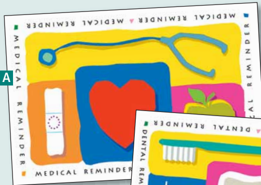
RM897B-1 Standard LRM973 Laser

Keep patients healthy and coming back with recall cards.