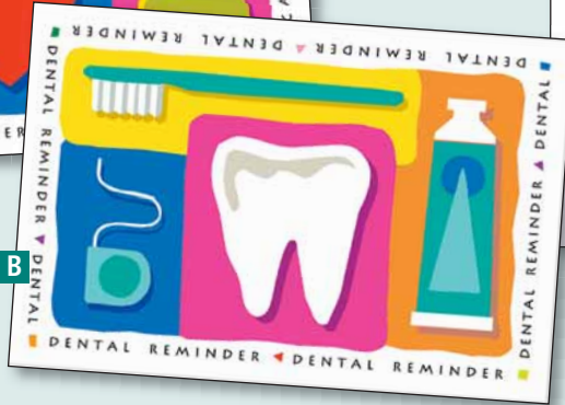
RP897B-1 Standard LRP961 Laser